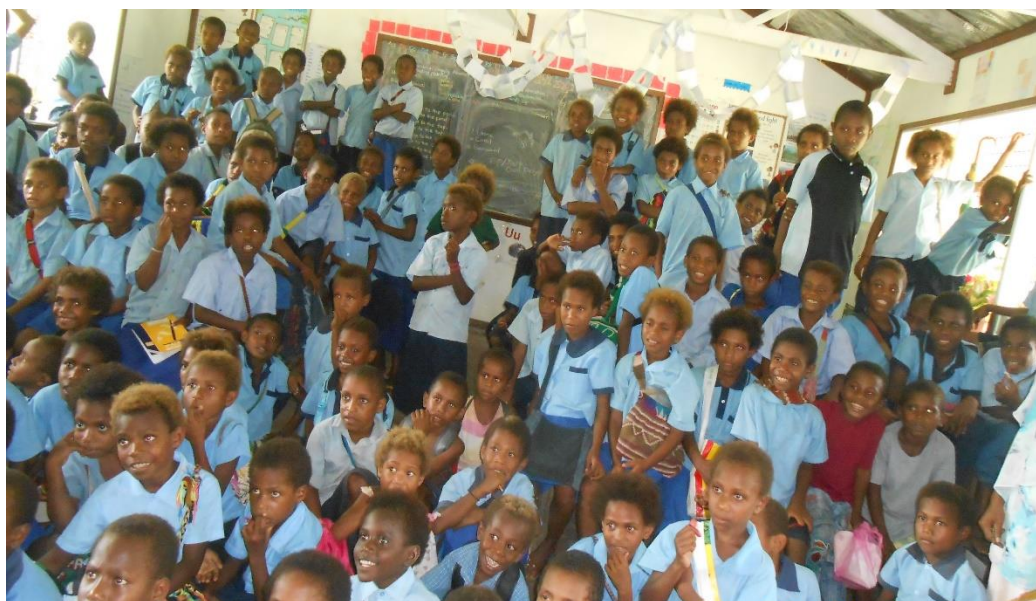
Photo: Max Benjamin Elementary School students at MEEP Outreach session

5. A MEEP Past-Graduates Database has been designed, tested and an awareness campaign started to make contact with MEEP alumni beginning with 1997 - 1998. Related articles featured in the Post Courier and The National newspapers and items are appearing on MND’s Facebook. MEEP alumni are asked to make contact with MND via email, help MND update alumni contact details and complete a short survey. The aim is to evaluate the long-term impact of MEEP on marine environment conservation attitudes. PAST MEEP GRADUATES please contact MND by EMAIL.